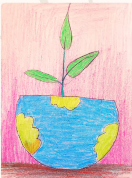
CHRISTINA CHEERAN BINU, I - B